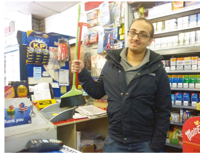
Local shop keeper signs up for Keep Loughborough Junction Clean campaign

shop keepers to keep their forecourts swept and litter free and to water any nearby planters.