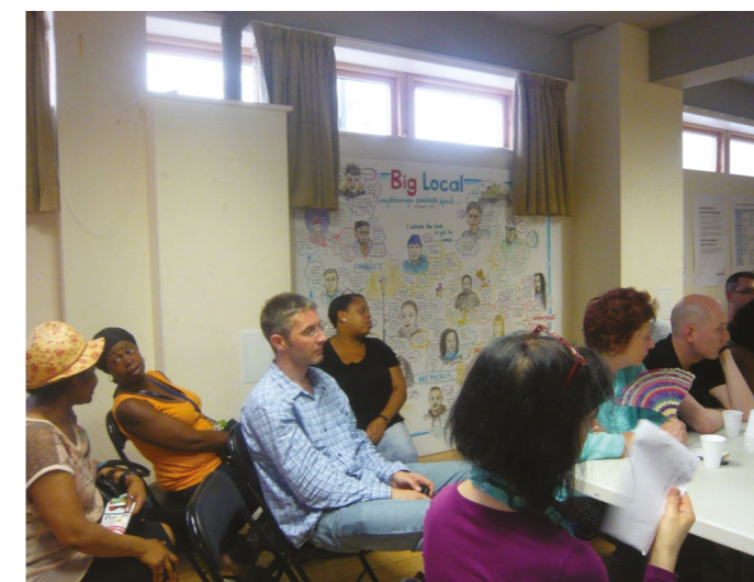
NEP co-design workshop at the Loughborough Centre

LJAG ran a co-design workshop in conjunction with Lambeth Council on the Neighbourhood Enhancement Programme (NEP).