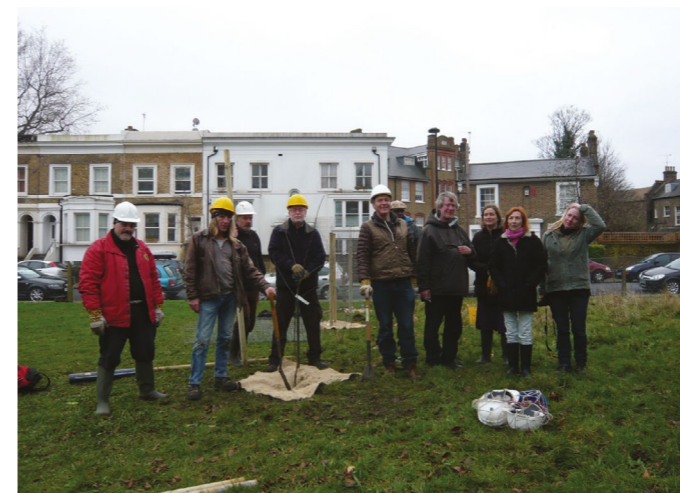
Loughborough Farm plant an orchard in Wyck Gardens

Further sites are being explored. A site on Minet Road opposite Loughborough School is being cleared and should be ready to occupy at the end of July. We are working with the Lost Effra Project, run by the London Wildlife Trust, and residents of Lambeth Living flats in Southwell Road to establish a garden and food growing project behind their flats. This would involve removing a large area of unused concrete with flood alleviation funding from Defra. Additional fundraising would be required to establish the garden. We held a consultation event and all residents were keen to have a garden with some reservations expressed over issues of privacy and maintenance.