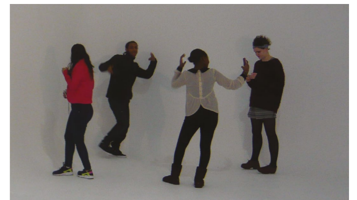
Made in Loughborough Junction students at photographic studio