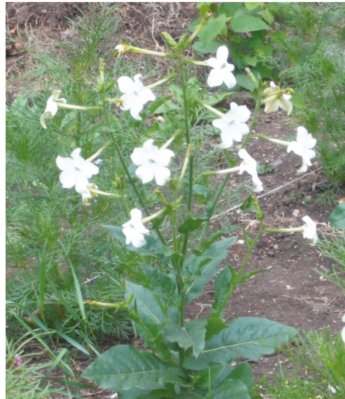
Tobacco plant at flower bed at Bill Board Corner