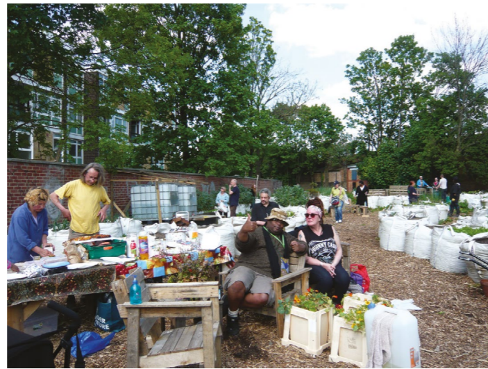
Loughborough Farm celebrates with pizza with Brockwell Bake

During the winter the farm was open every Saturday afternoon and thanks to the mild weather every volunteer was able to take home a bag of salad crops and greens at the end of each session. The mobile pizza oven owned by the Brockwell Bake is kept at the farm and has been used on three occasions to make pizza for our volunteers.