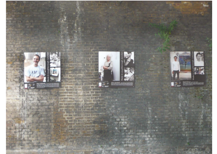
Made in Loughborough Junction exhibition on Hinton Road bridge