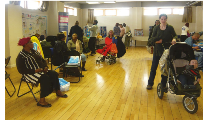
Be Well day at the Loughborough Centre

Lipton Youth Centre with the involvement of Sports Fusion Development.