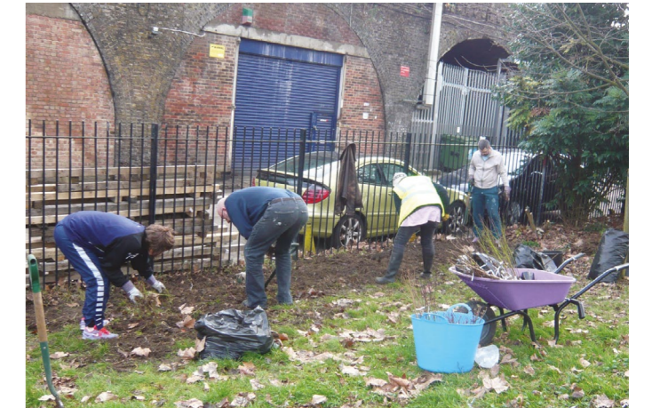
Loughborough Farm planting native hedge in Elam Street Open Space

The Loughborough Farm organised four volunteer events for One Planet Ventures, which had funding from WREF, over four Sundays in February and March in Elam Street Open Space. The volunteers planted a new hedge along the fence overlooking Wickwood Street and cleared half the wetland area and planted new wetland plants. LJAG received a fee of £1,000 which allowed us to pay a volunteer a small fee to run the sessions and to provide the other volunteers with a hot lunch.