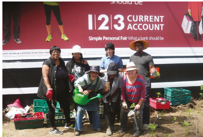
LJAG and Loughborough Farm volunteers digging up the grass at Bill Board Corner