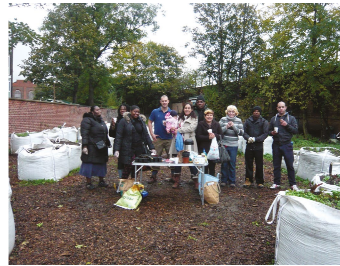
Volunteer farmers at the Loughborough Farm

The Loughborough Farm is also supported by the community gardener at the Myatts Fields project who has held monthly training sessions for volunteers and we have been able to extend our growing season with seed planting at the Myatts Fields greenhouses.