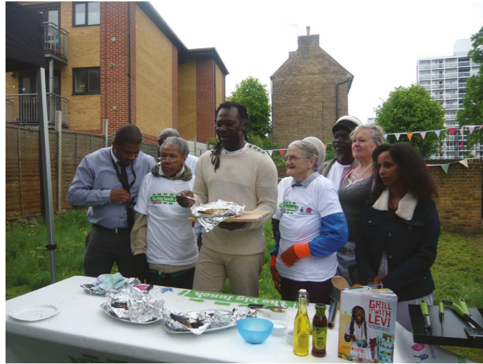
Eden Project Big Lunch launch with Levi Roots at the Marcus Lipton Youth Centre

LJAG helped the Eden Project launch its 2013 Big Lunch campaign at the Marcus Lipton Youth Centre where local celebrity Levi Roots demonstrated some delicious Caribbean barbecue recipes.