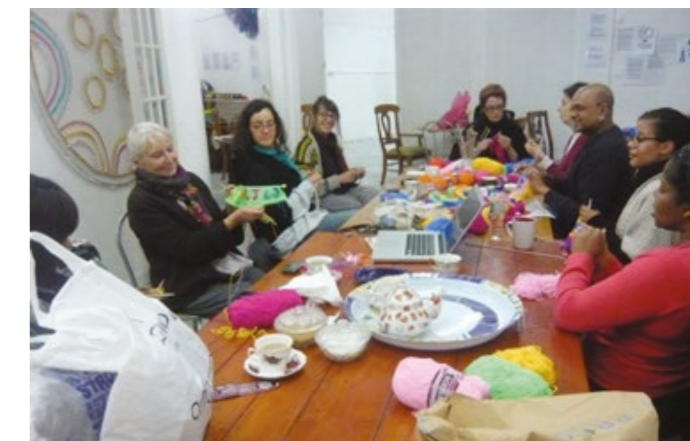
Knitting workshop for yarn bombing at Big Lunch