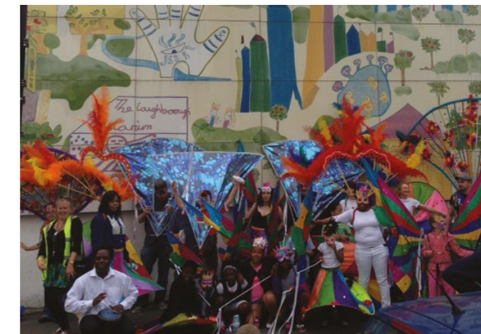
Big Lunch 2013 carnival

LJAG hosted a Big Lunch on Sunday 2 June 2013 in Hero Square, the public space in front of the shops on Loughborough Road. The day was a big success: the space was transformed with bunting; there were two sound systems, one mounted on a bike; a jerk chicken stall; a barbecue; free vegetarian food from the Brixton People's Kitchen; a cake competition and a bouncy castle. Some 500 people attended at some point during the day. However, the highlight was the pavement carnival parade from Sunshine International Arts in Coldharbour Lane to the Big Lunch and the colourful yarn-bombing (the installation of colourful knitting attached to lamp posts and street furniture) of the area led by The House in the Junction project. The carnival parade was supported by two carnival making workshops in the weeks running up to the event. A community knitting workshop was also held to complete the knitting for the yarn-bombing.